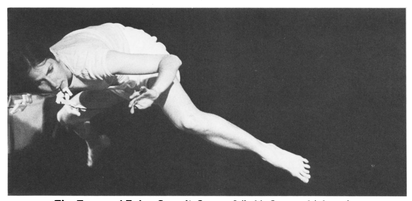
The True and False Occult: Scene 3 (left), Scene 4 (above)